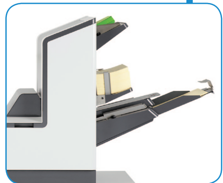
Tower Feeder with Accumulation/Divert Deck

Formax - New Hampshire, USA www.formax.com