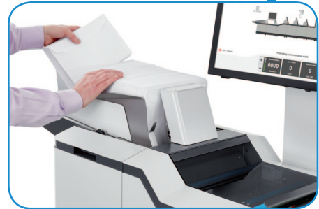
High-Capacity Envelope Feeder