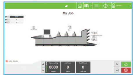
22" Color Touchscreen Interface